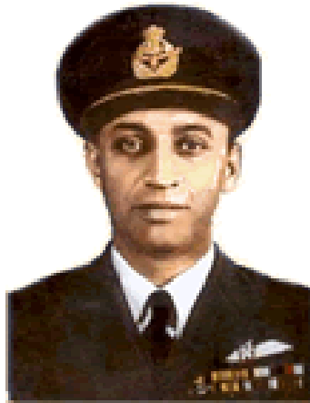
Air Marshal Subroto Mukerjee, OBE

Air Marshal Subroto Mukerjee OBE (05 Mar 1911- 08 Nov 1960) lived a life of determination, dedication and total commitment to the cause of the service that he guided from its inception until its transformation into the Air Arm of independent India. In the early 1930's, when the British government in India could no longer ignore the growing demands of the Indian people for greater representation in the higher ranks of the defence services, it grudgingly began the process of 'Indianisation' of the services. As a result, the Indian Air Force (IAF) came into being on 08 October 1932.